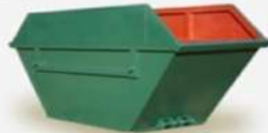
9m 3 Skip

Instead of both front & back being open, either side can be closed, taking into consideration that loading & emptying the bin can only be done from one side.