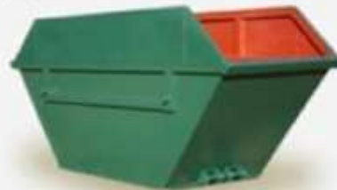
9m 3 Bin

Instead of both front & back being open, either side can be closed, taking into consideration that loading & emptying the bin can only be done from one side.